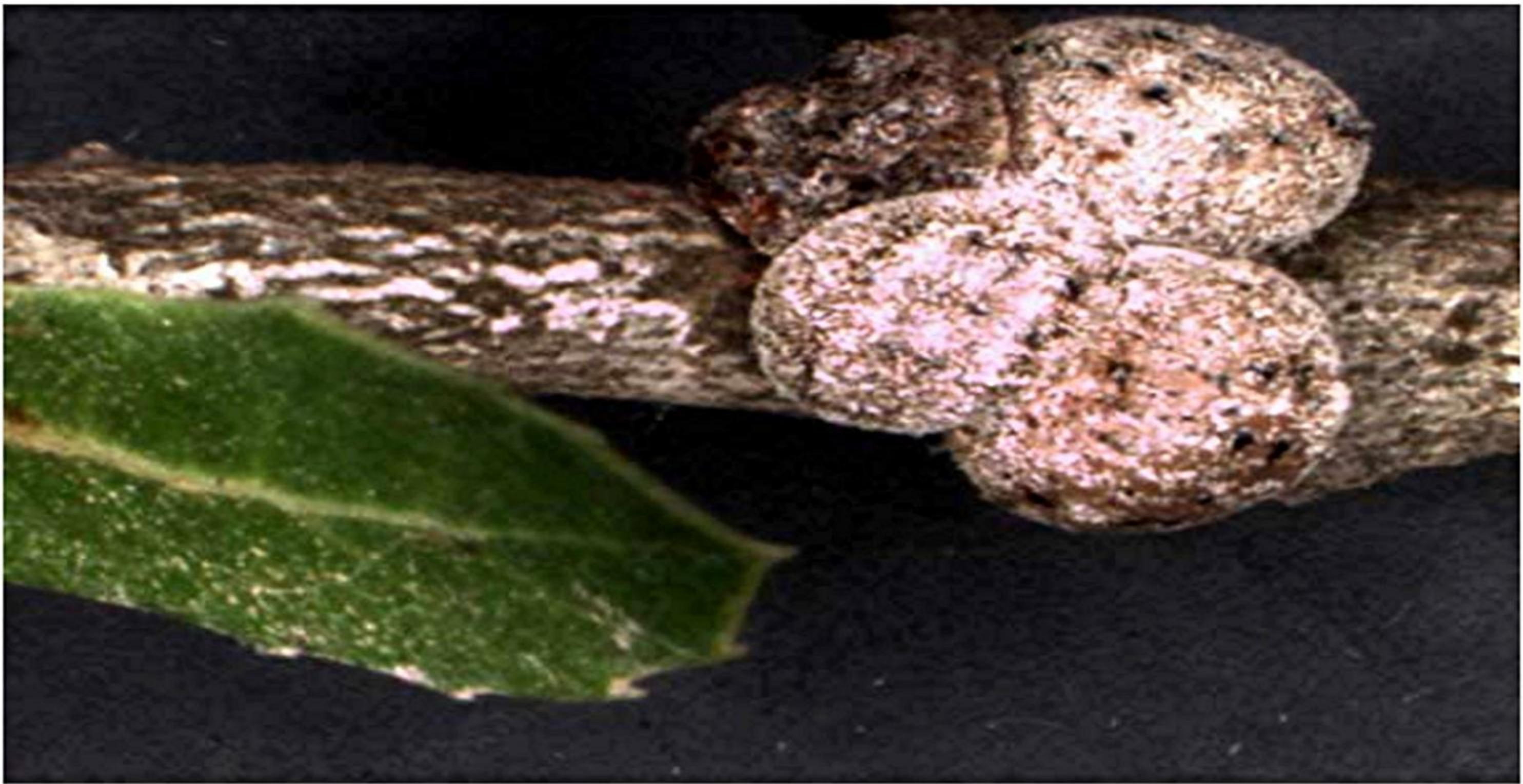
A magnified photograph of the tola'at shani.