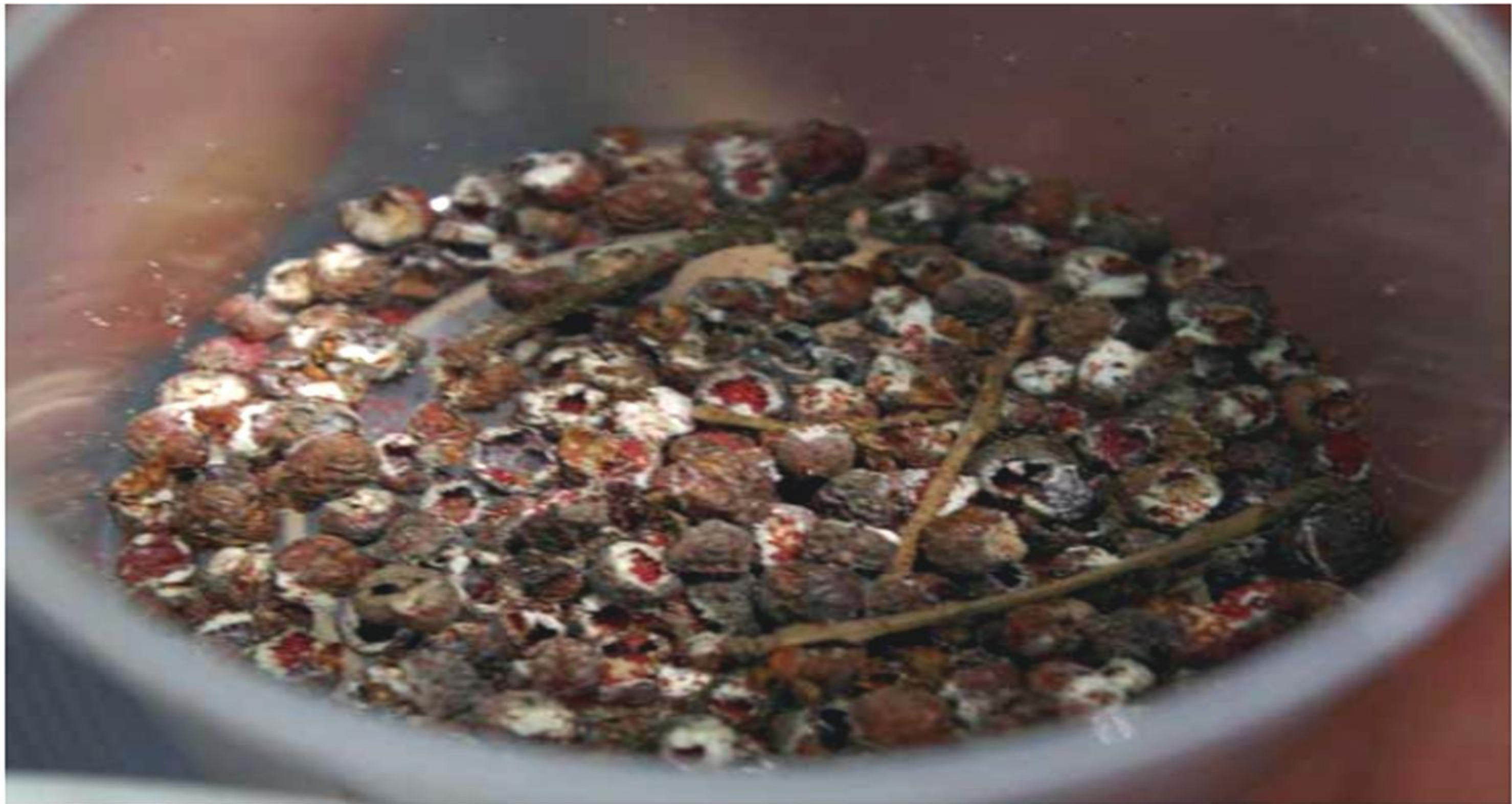
Freshly gathered tola'ot. The red "filling" are the eggs.