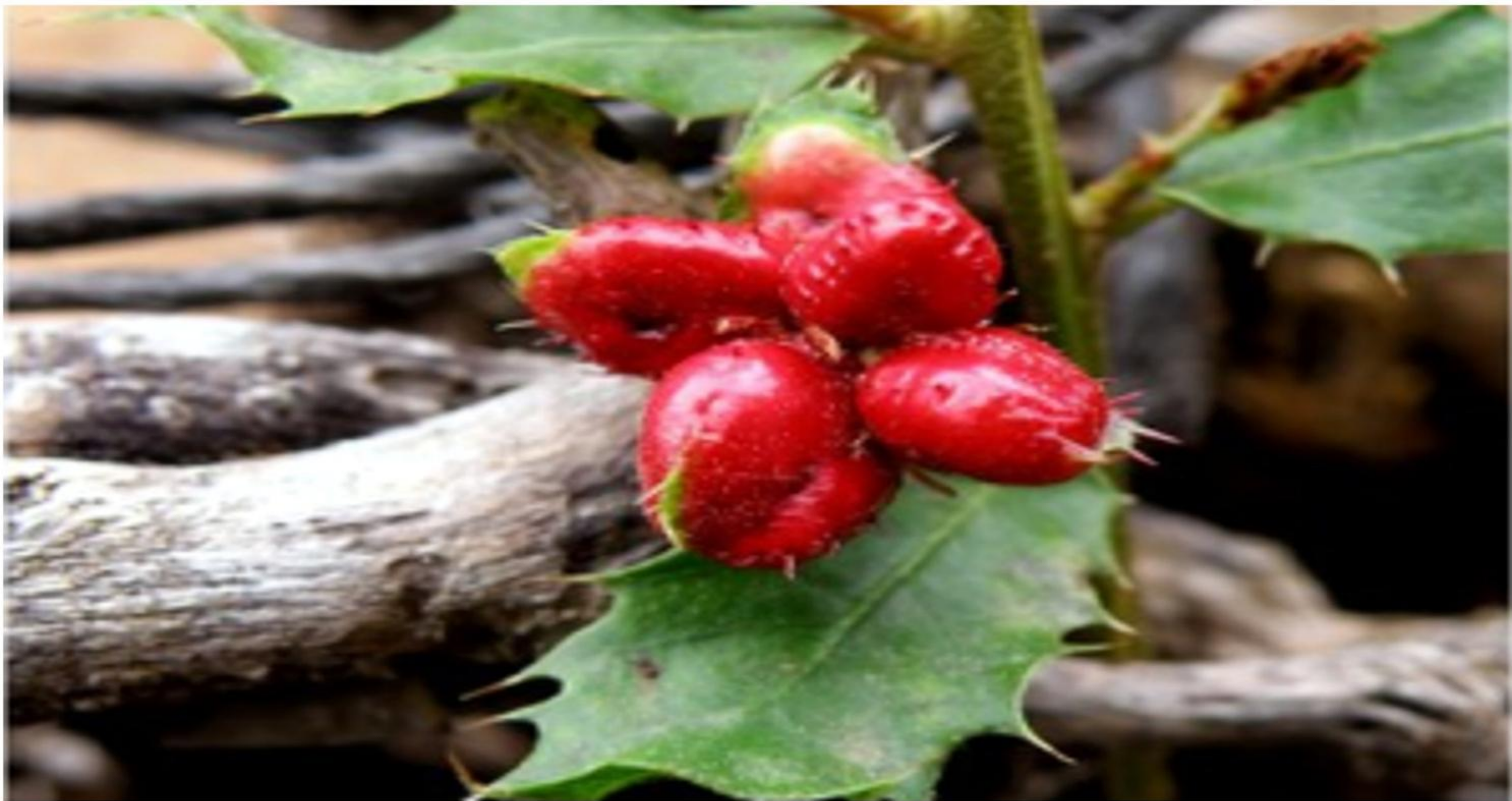
The female tola'ah attached to a branch.